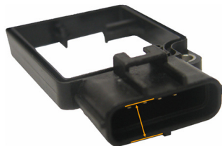
Figure 1: Arrows indicate critical dimensions